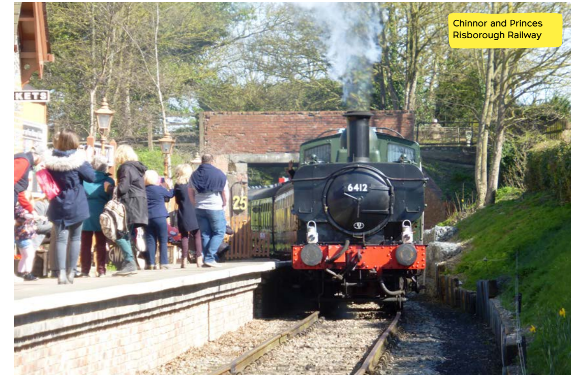
Chinnor and Princes Risborough Railway

Set in 1800 acres of glorious parkland. Magnificent state rooms, authentic Servants' Quarters. Victorian walled garden, yew maze and tearoom. Garden centre, ancient chapel, arboretum and Stansted light railway. On the Hampshire/West Sussex border. Available for weddings and private hire.