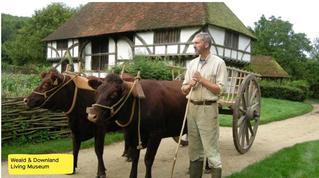
Weald & Downland Living Museum

As featured in Country Life and The Dorset Magazine . A fine Tudor/Georgian manor house with Victorian stables and 12th century church nearby, 6 acre garden and 1 acre organic walled garden. Teas on some Wednesdays in April & October only. In Cranborne Chase between Cranborne and Verwood, off the B3081.