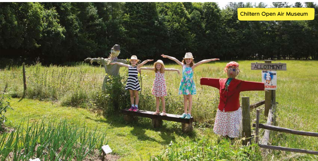
Chiltern Open Air Museum