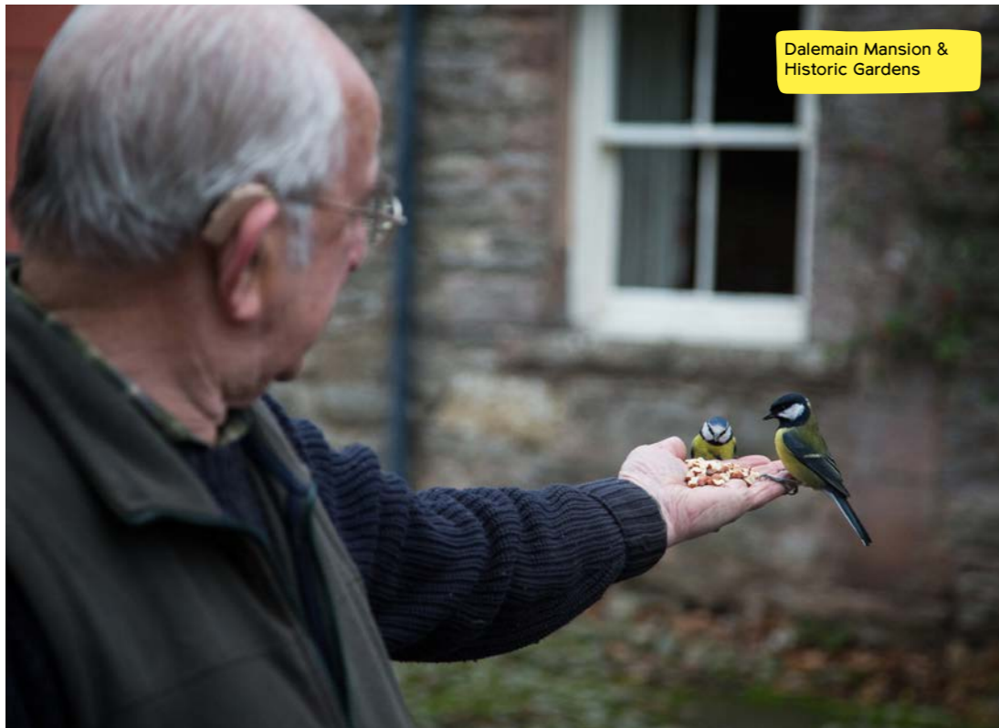
Dalemain Mansion & Historic Gardens