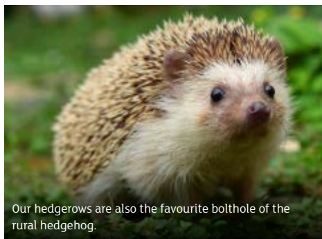
Our hedgerows are also the favourite bolthole of the rural hedgehog.

With your support, we're calling for stronger legal protections for hedgerows – and to see them restored and well managed – to help preserve the beauty, history and character of our countryside.